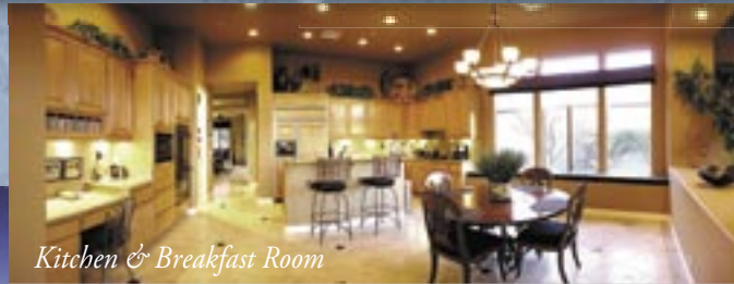
Kitchen & Breakfast Room